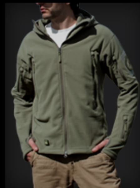
Recon Hoodie $219.95