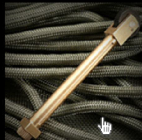
Survival Spark $19.95