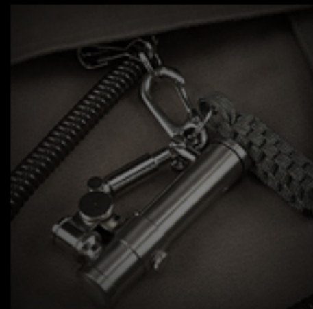
Clips & Split Rings $74.95