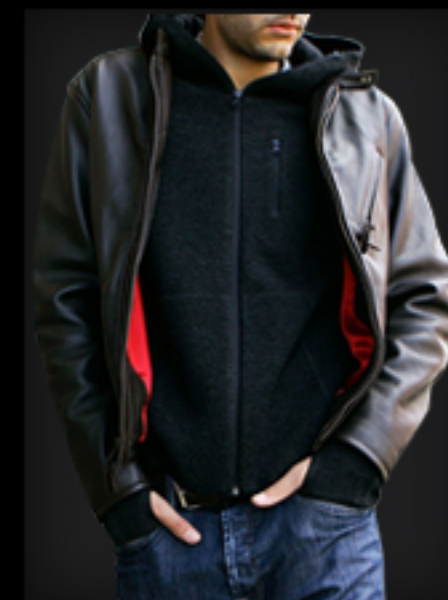
Merino Praetorian Hoodie $169.95