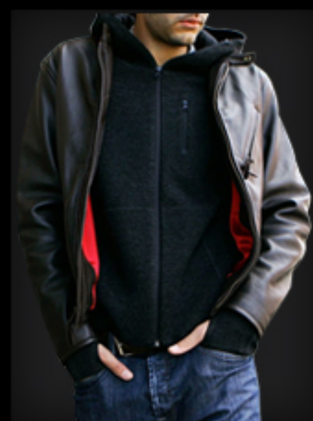
Merino Praetorian Hoodie $169.95