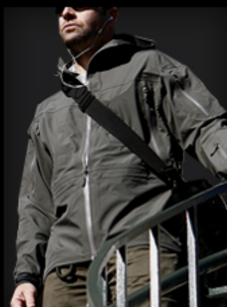
Spectre Hoodie LT $279.95