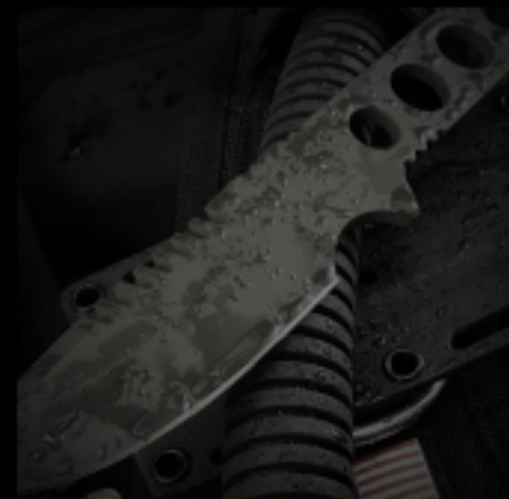
Strider/TAD DUK $235.00