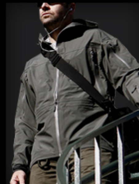
Spectre Hoodie LT $279.95