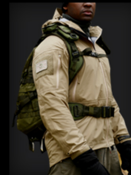
Spectre Hoodie LT $279.95