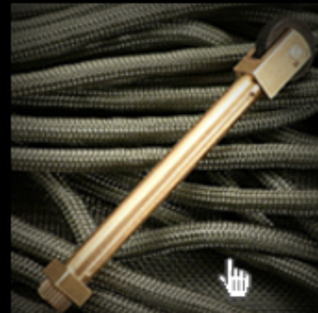
Survival Spark $19.95