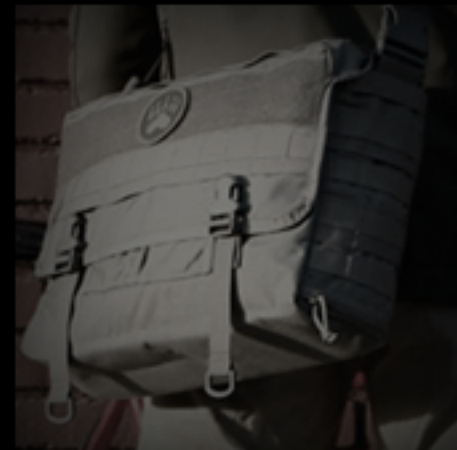
Dispatch Bag Sz2 $193.95