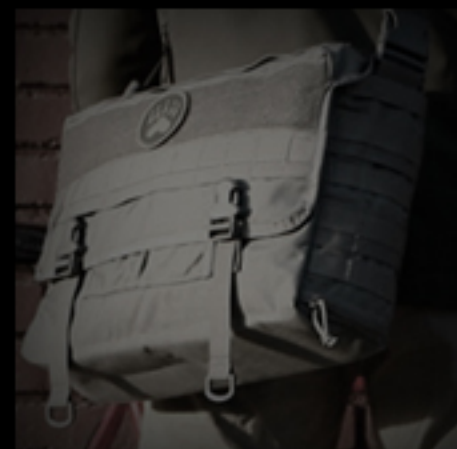
Dispatch Bag Sz2 $193.95